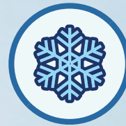
Shivering and chills